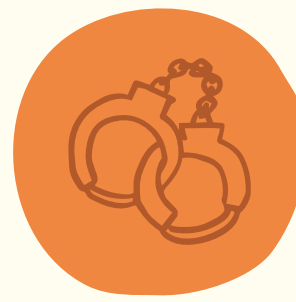
forced labour & human trafficking