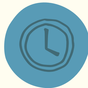
work hours, wages & benefits