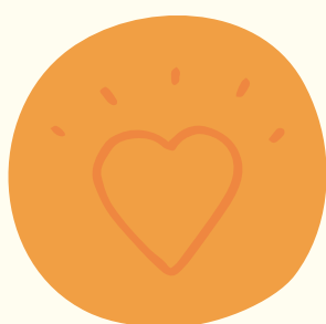
respect for human rights