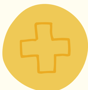
safe & healthy workplace