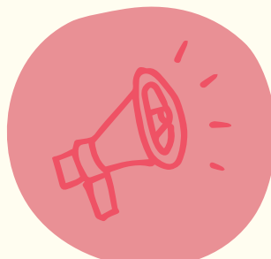
freedom of association & collective bargaining