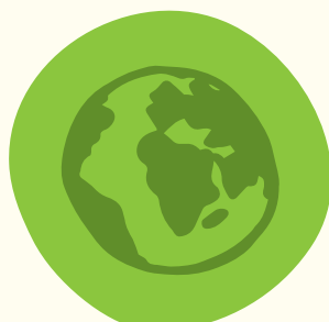
community & stakeholder engagement